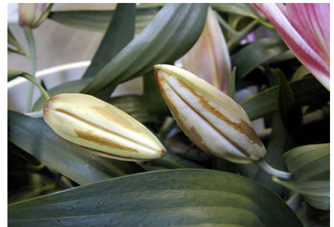
Postharvest Bud Necrosis, a new problem being investigated by the Flowerbulb Research Program at Cornell University. These buds are from the cultivar 'Sissi', and the browning began after 4-5 days in a 3C cooler.

This project is just getting started. The American Floral Endowment has generously agreed to fund a proposal we wrote on a problem we are calling "postharvest bud necrosis" in oriental hybrid lilies (see photo below). Growers in the southern US especially see this problem in summer crops. The plants look fine in the greenhouse, but if cold-stored after forcing, rapidly (within a few days) develop dark spots and blotches on the buds in the cooler . The cause of this problem is not known, but we do know that cultivars vary in their susceptibility. For example, 'Mona Lisa' and 'Sissi' are sensitive. We will be starting work on this problem this summer, and will report our findings as they develop in the future