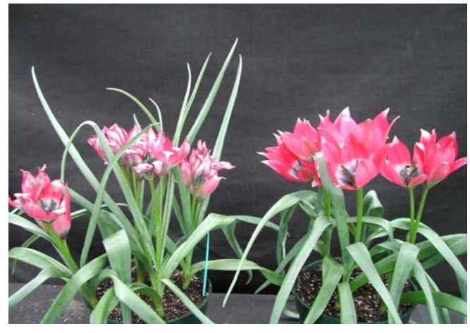
Effect of Fascination sprays on the appearance of the species tulip 'Little Beauty'. Left: control plant (sprayed with water) and right, a plant sprayed with 100 ppm Fascination.

The above results for Fascination and lilies may be only the beginning for the potential of this chemical for flowerbulbs! In 2004, Martijn Verlouw, our Dutch student intern for the year, became interested in Fascination, and conducted an experiment with two species tulips. The results were quite stunning. It was clear that the Fascination sprays dramatically increased the flower life for both cultivars, as shown in the photo. There did not appear to be any effect of the gibberellin in terms of stretching the upper internode.