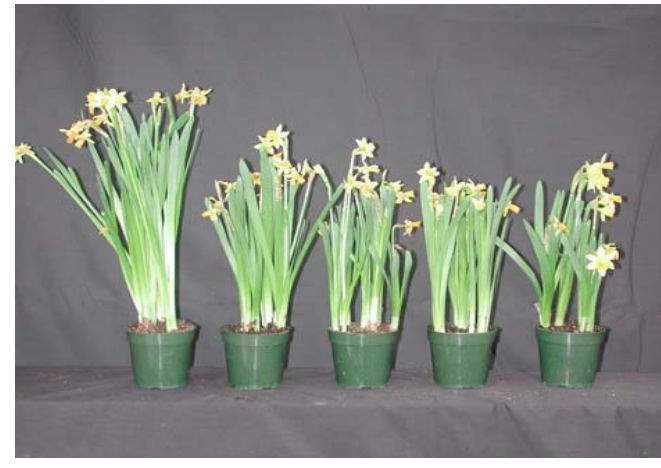
12/14 cm Tête-à-Tête plants nearing the end of flowering. After dipping in Bonzi, bulbs were cooled 15 weeks, forced to bud color, then held 7 days in a low-light, 20C postharvest room. L to R: Control, 50, 100, 200, 400 ppm Bonzi, given as 10 minute pre-plant dip.

Even though Tête-à-Tête is a "dwarf" daffodil, its postharvest growth (while flowering) is excessive and it is desirable to reduce this growth. To this end, we have trialed Bonzi or Piccolo (paclobutrazol), Sumagic (uniconazole), and TopFlor (fluprimidol) as possible plant growth regulators (PGRs) for Tête-à-Tête. Throughout these studies, when applied at similar economic rates (e.g., at similar PGR material cost per pot or per bulb), paclobutrazol (Bonzi or Piccolo) have consistently been more effective than Sumagic (unicolazole). We have also seen excellent results with TopFlor, but this chemical is currently under development and not yet on the market. Dipping bulbs for 120 minutes into 50-100 ppm paclobutrazol (Bonzi or Piccolo) with bulb cooling durations of 14-15 weeks has been effective.